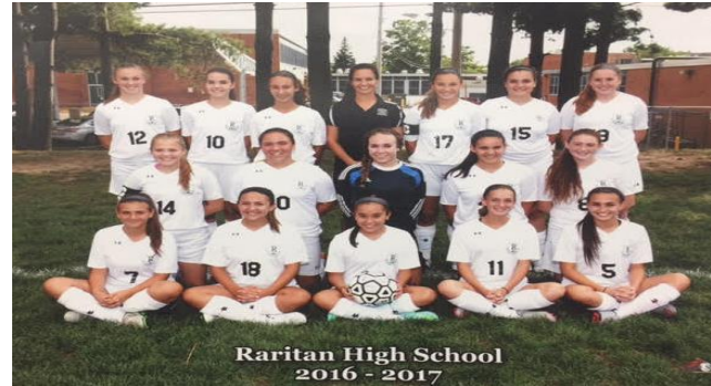
Raritan High School 2016 - 2017